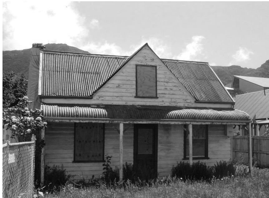
Grubb Cottage.